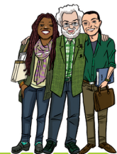
The cool teachers

...AND PICK-UP THE SCREEN AND CARDS FOR THIS CLIQUE, ALONG WITH 5 POPULARITY POINTS.